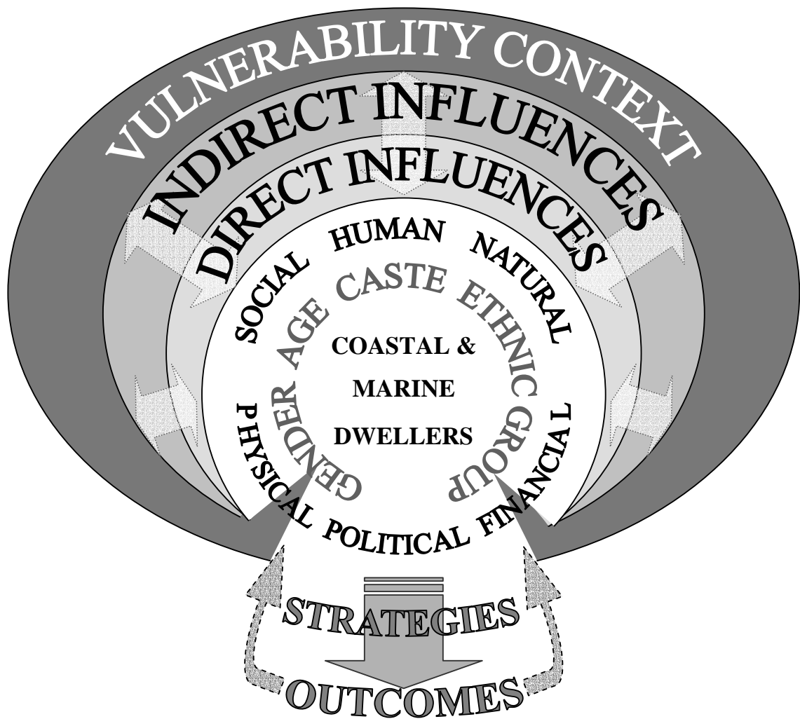
Figure 1 A Framework for Understanding Coastal and Marine Livelihoods

Depending on their gender, age, caste or ethnic group, different people living around the coasts of the Bay of Bengal may (or may not) have access to different set of “livelihood assets”. Given the ecosystem focus of the BOB-LME, it might seem logical to concentrate principally on the “ natural assets ” that people draw on for their livelihoods –natural resources like fish, water, the sea, coastal swamps, the work, food and produce derived from these resources and people’s ability to access those resources. But those